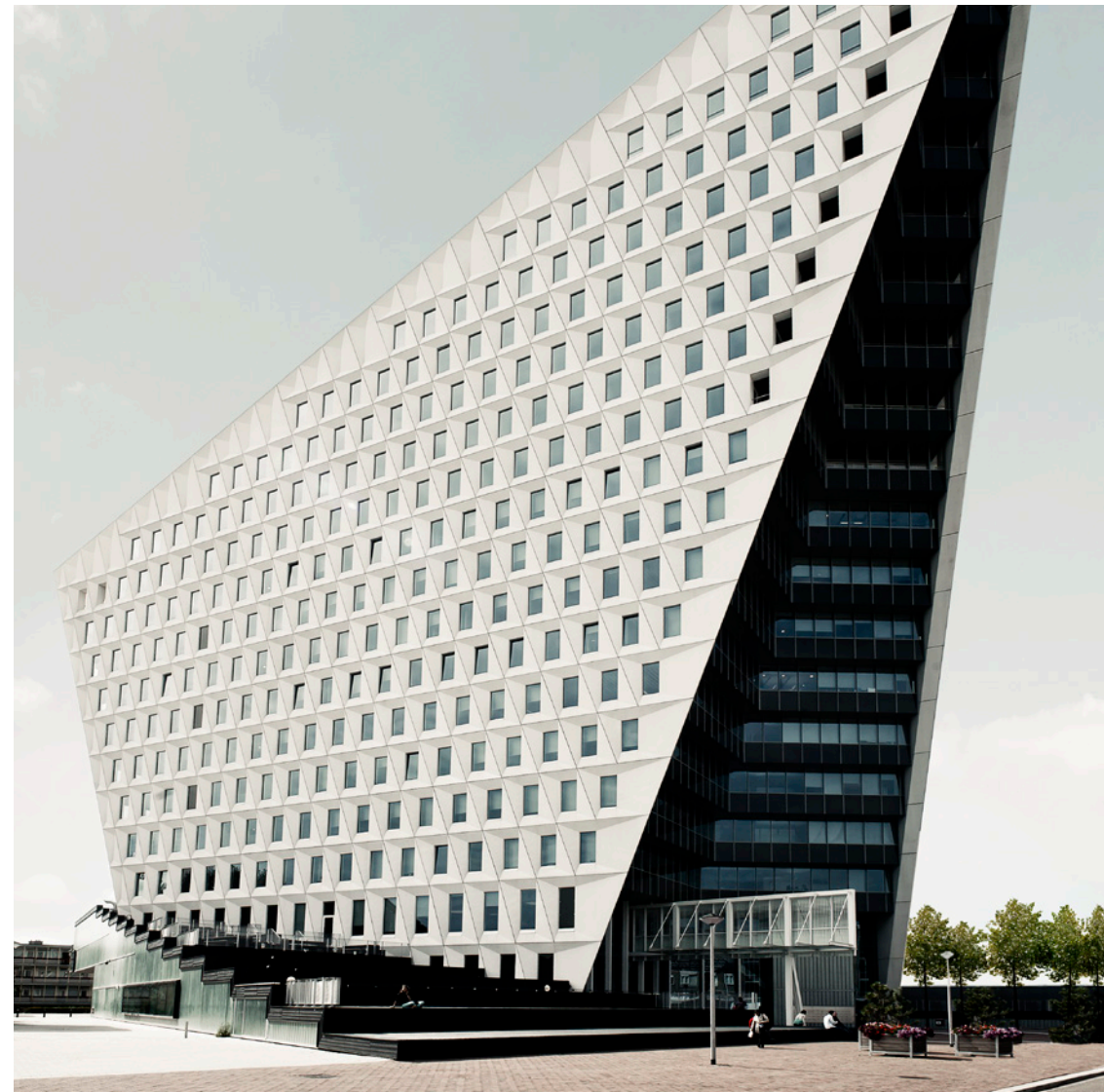
City office Leyweg, The Hague

Curious to know what the optimal design is for your project? Contact us.