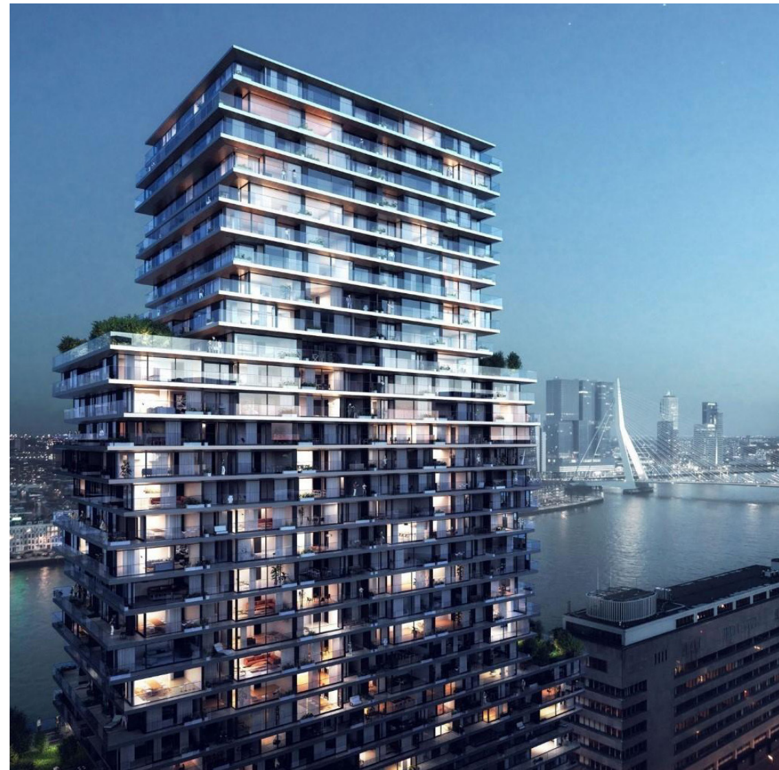
The Terraced Tower, Rotterdam

The Terraced Tower project is a unique masterpiece alongside the Maas shore in which the apartments are playfully incorporated. Its name says it all: this 100-metre high tower will include apartments with terraces and large balconies. A commercial row for catering and retail businesses is envisioned on the ground floor. This new and iconic building is a design of OZ Architect. Commissioned by BESIX NL, Byldis Facades is the proud facade builder of this project.