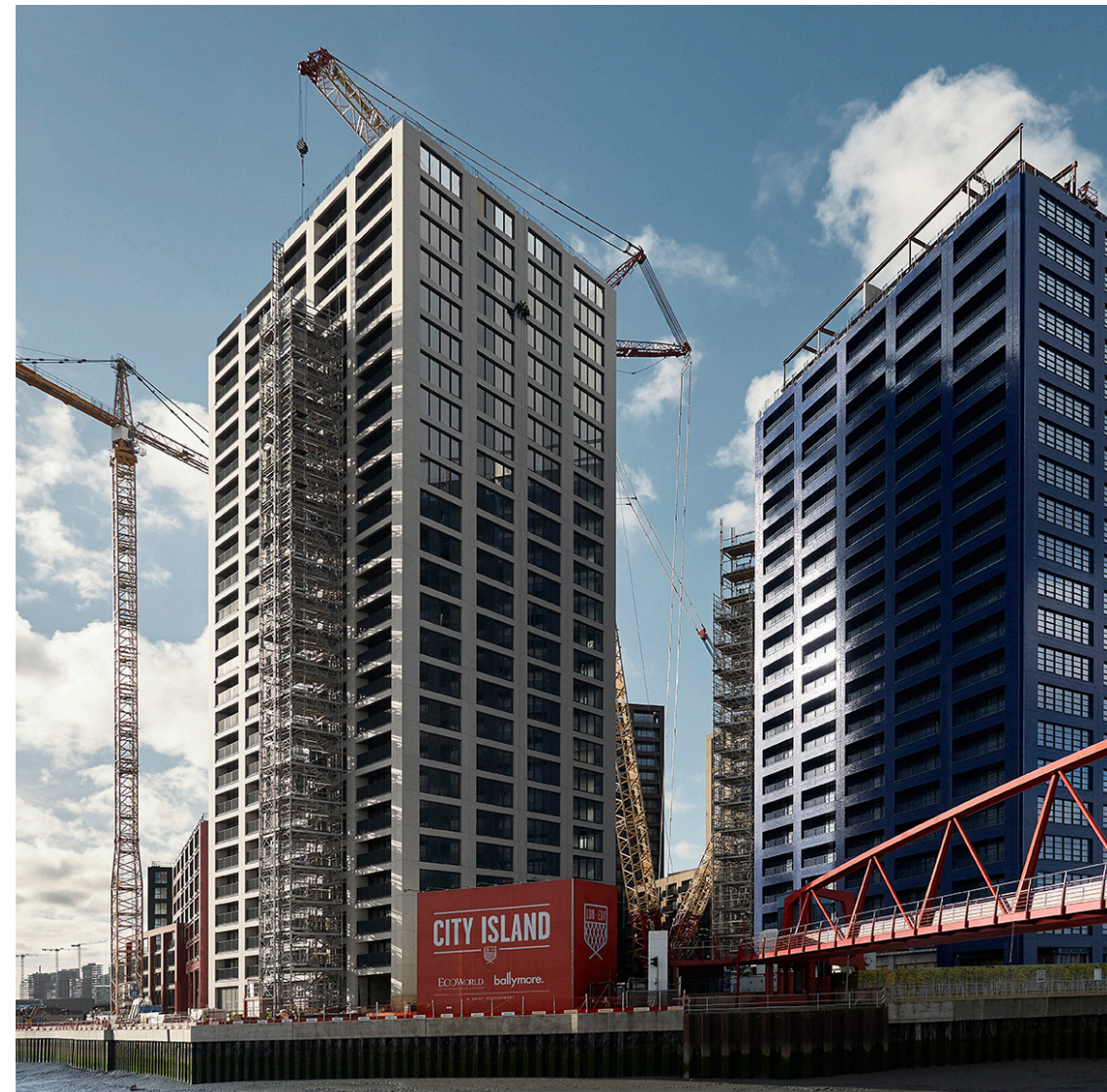
London City Island, London