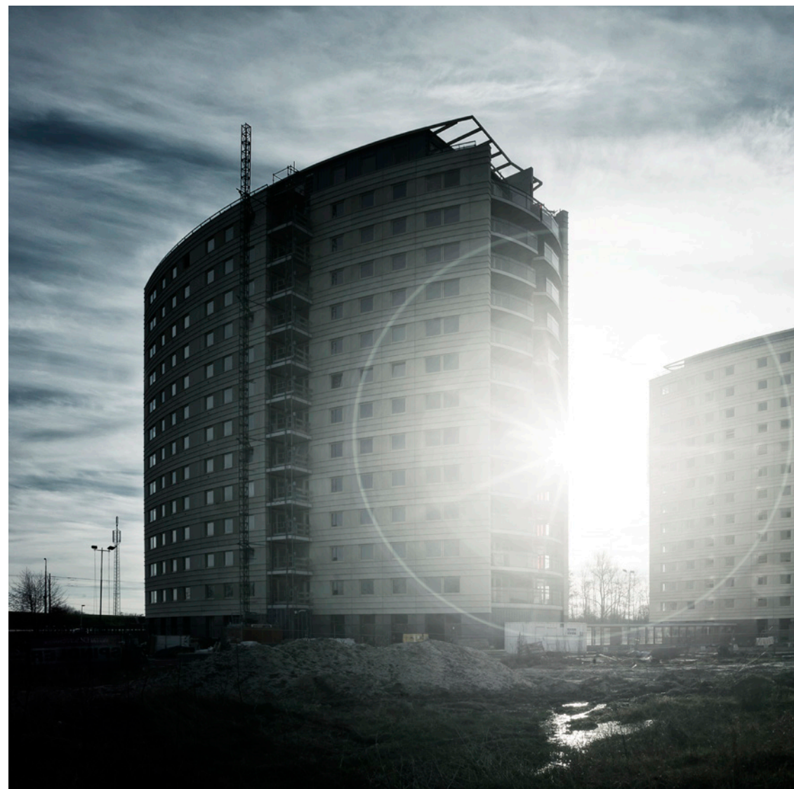
The Reigers, Rotterdam

Curious to know what the Return on Investment could be for your project? Contact us.