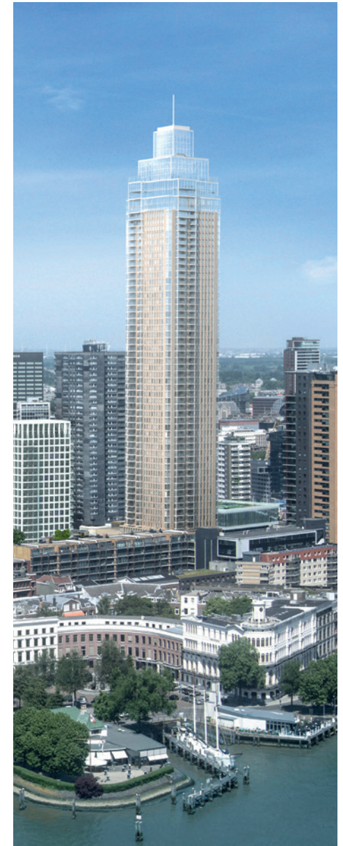
The Zalmhaven, Rotterdam

While Byldis Prefab is responsible for all the concrete elements of the Zalmhaven, Byldis Facades, specialist in aluminium facade systems is responsible for the production, supply and assembly of the aluminium fronts of the two low-rise towers and connecting plinth.