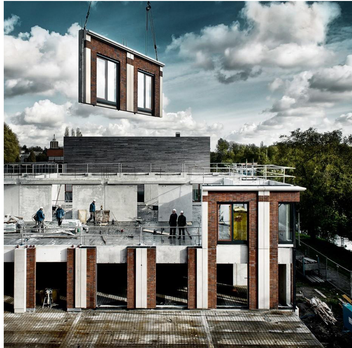
Domus Nostra, The Hague