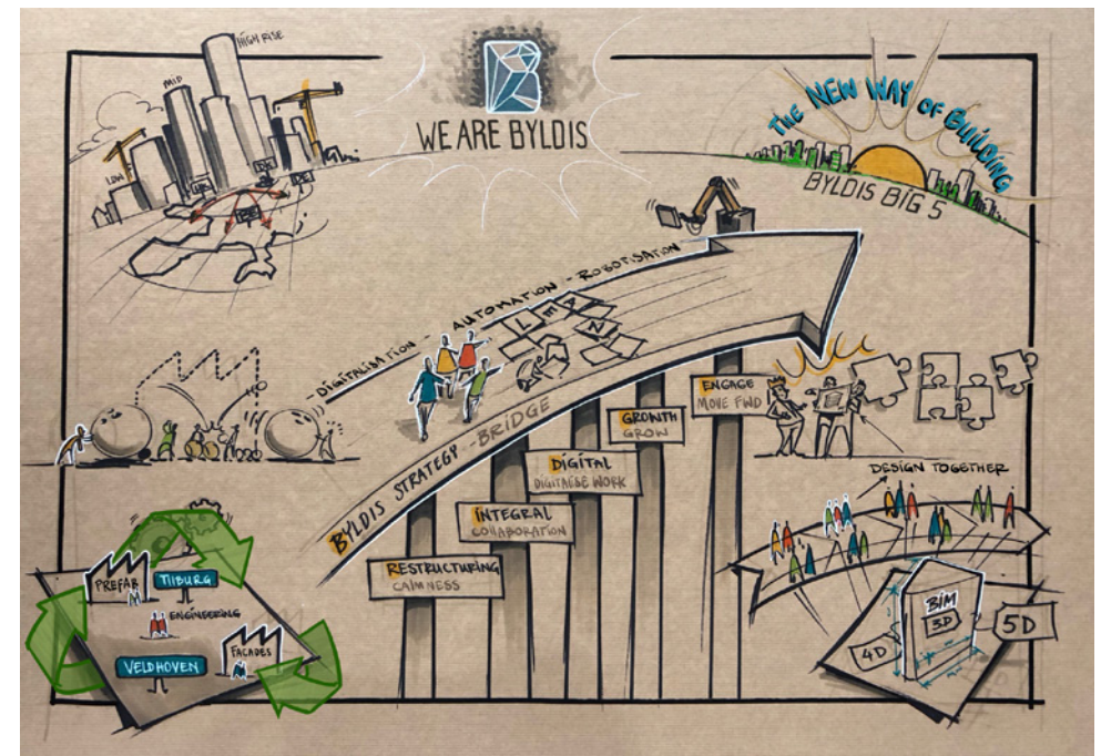
The Brown Paper - Byldis strategy.

https://commonslibrary.parliament.uk/research-briefings/cbp-7671