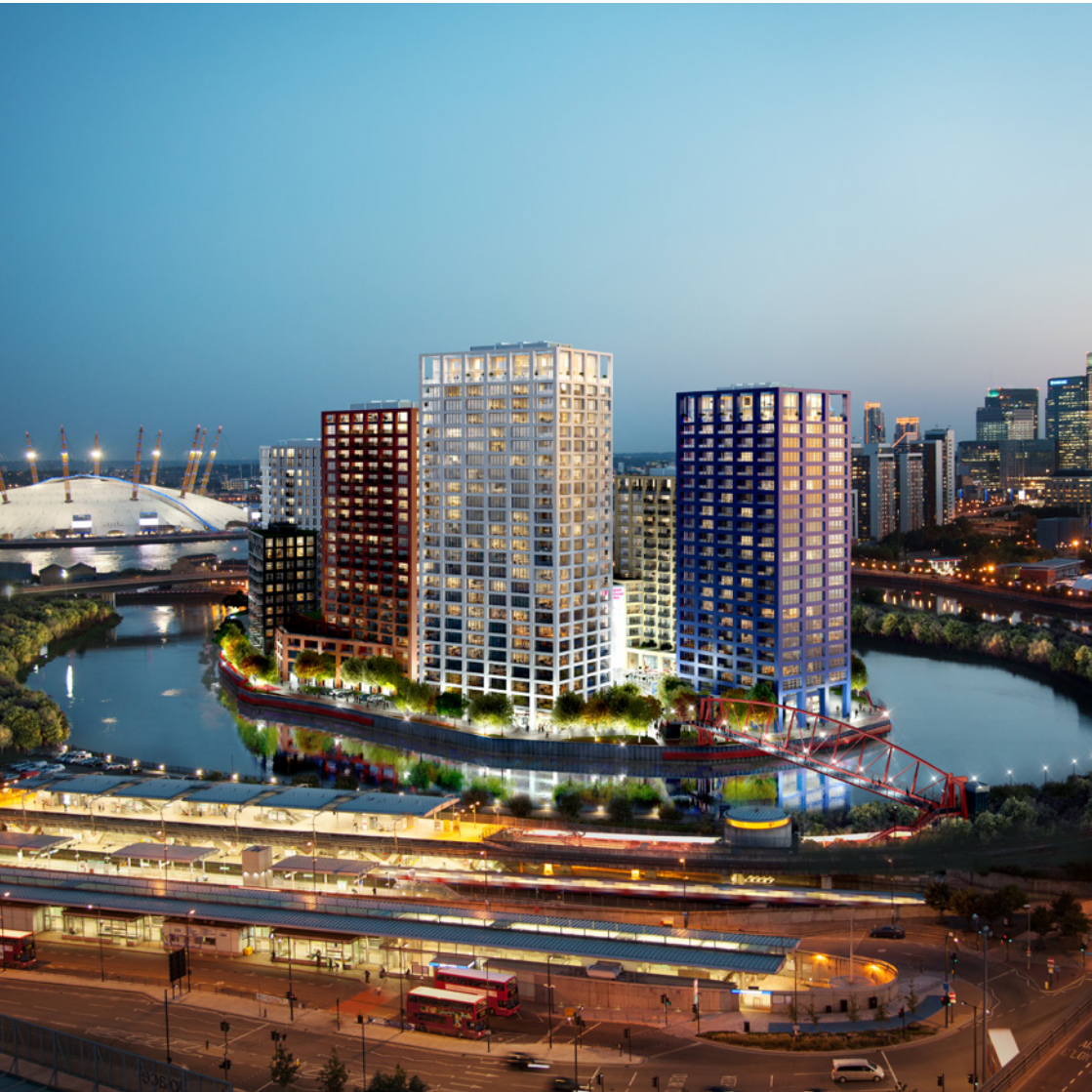
London City Island, London