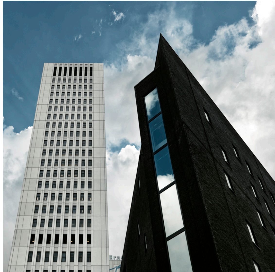
Erasmus Medical Centre, Rotterdam

On the website of Byldis you'll find our online portfolio. On the page 'Showcases' www.byldis.com/en/showcases you'll find more information about our projects and questions will be answered concerning: why was Byldis chosen, challenges & solutions, facts & figures.