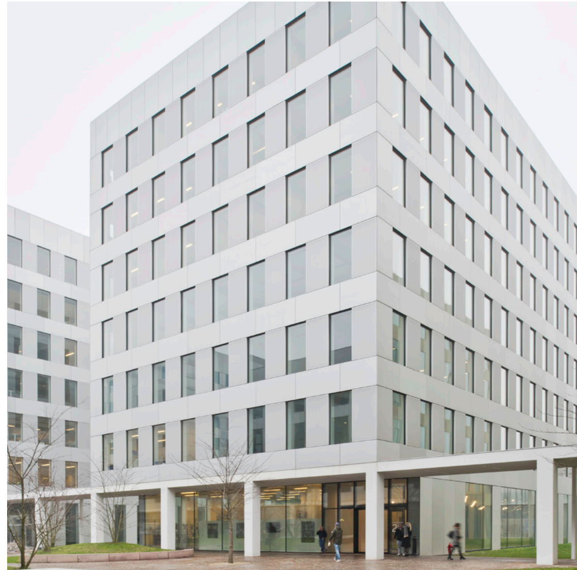
Post X, Antwerp

Curious about how we can elevate the face of your building to a higher level? Contact us.