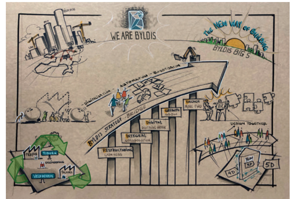
The Brown Paper - Byldis strategy.