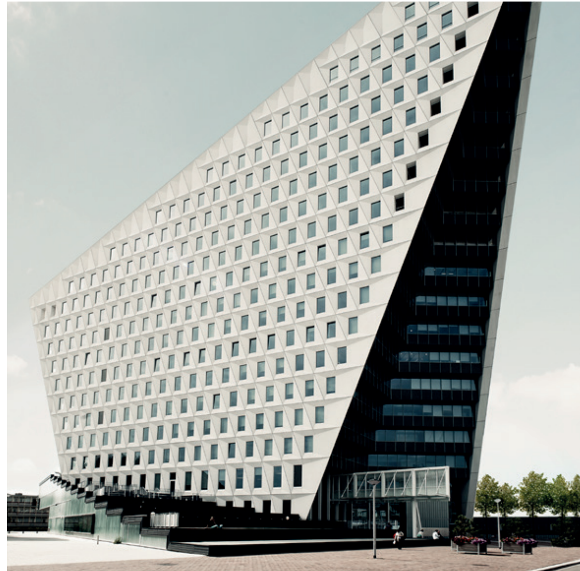
City office Leyweg, The Hague

Curious to know what the optimal design is for your project? Contact us.