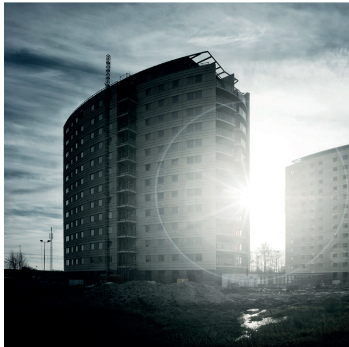
The Reigers, Rotterdam

Curious to know what the Return on Investment could be for your project? Contact us.