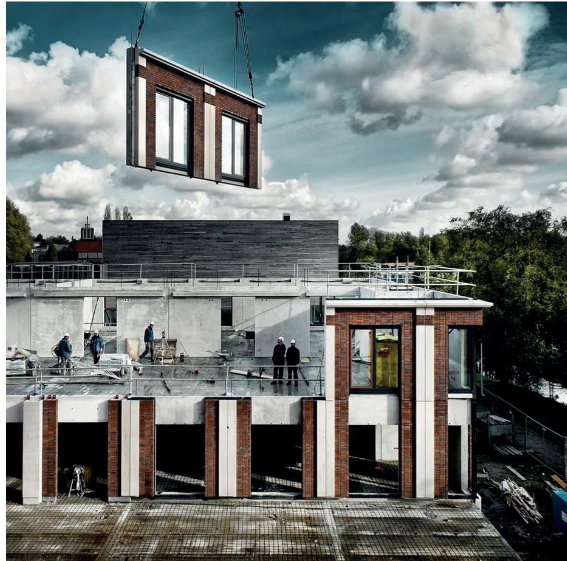
Domus Nostra, The Hague