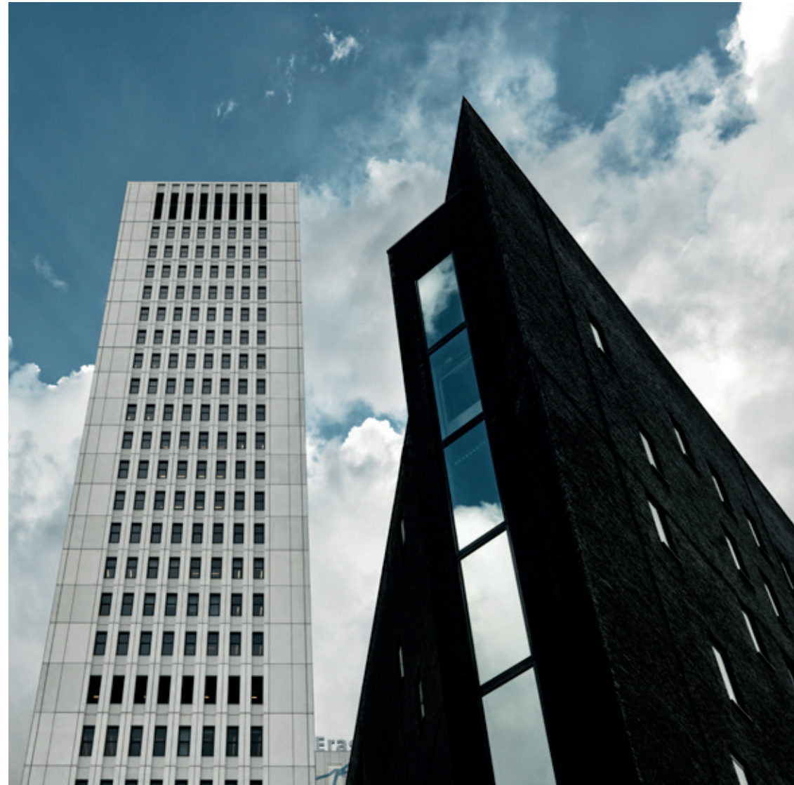
Erasmus Medical Centre, Rotterdam

On the website of Byldis you'll find our online portfolio. On the page 'Showcases' www.byldis.com/en/showcases you'll find more information about our projects and questions will be answered concerning: why was Byldis chosen, challenges & solutions, facts & figures.