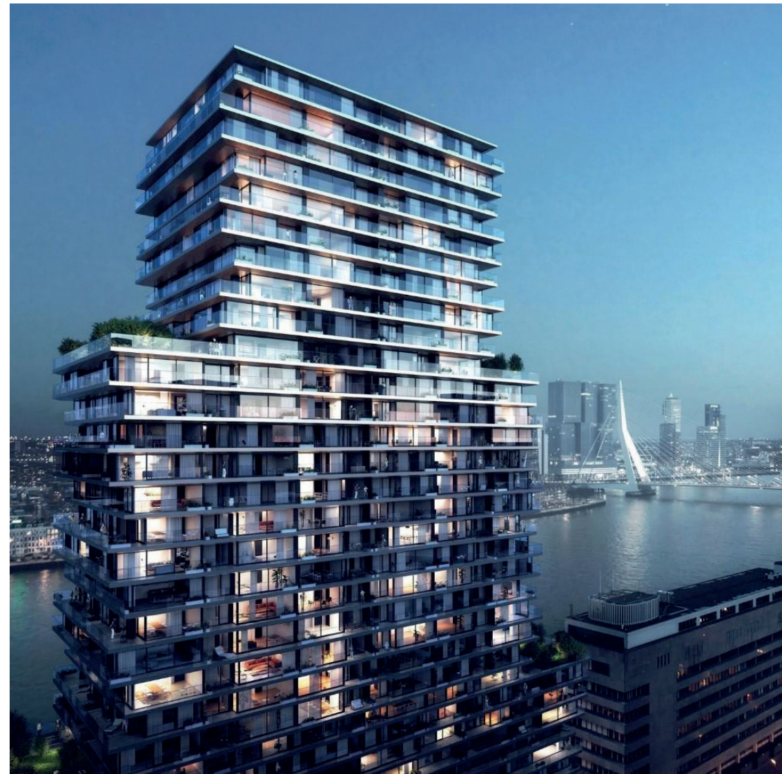
The Terraced Tower, Rotterdam

The Terraced Tower project is a unique masterpiece alongside the Maas shore in which the apartments are playfully incorporated. Its name says it all: this 100-metre high tower will include apartments with terraces and large balconies. A commercial row for catering and retail businesses is envisioned on the ground floor. This new and iconic building is a design of OZ Architect. Commissioned by BESIX NL, Byldis Facades is the proud facade builder of this project.