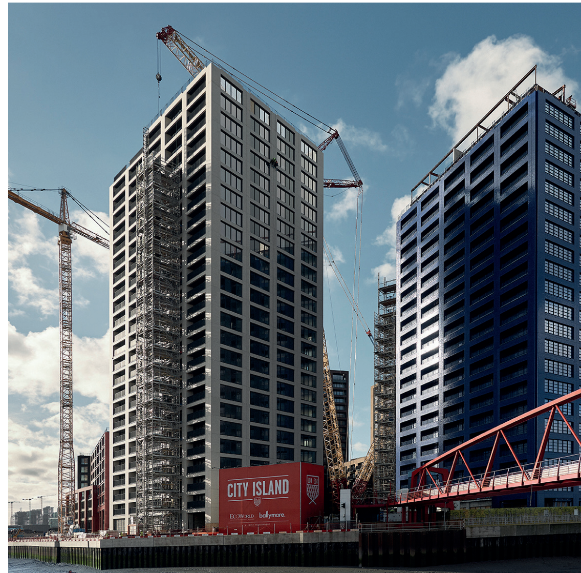
London City Island, London